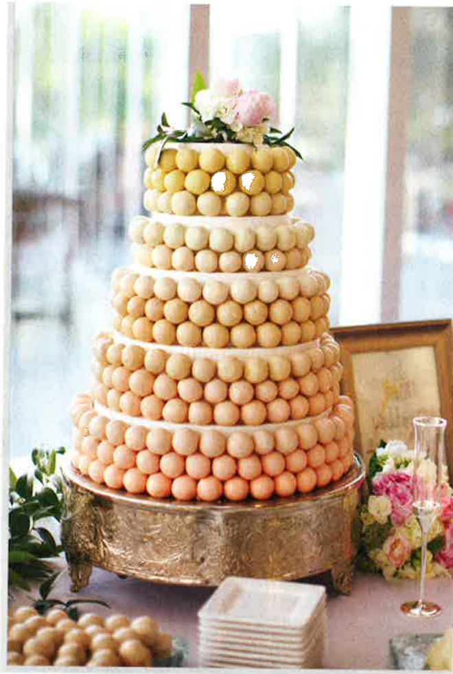
OMBRE CAKE BALL TOWER DESIGN Brew Ha-Ha!